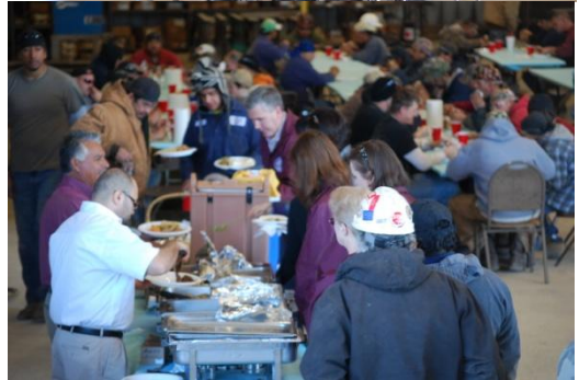
FALL 2011 FAJITA LUNCH